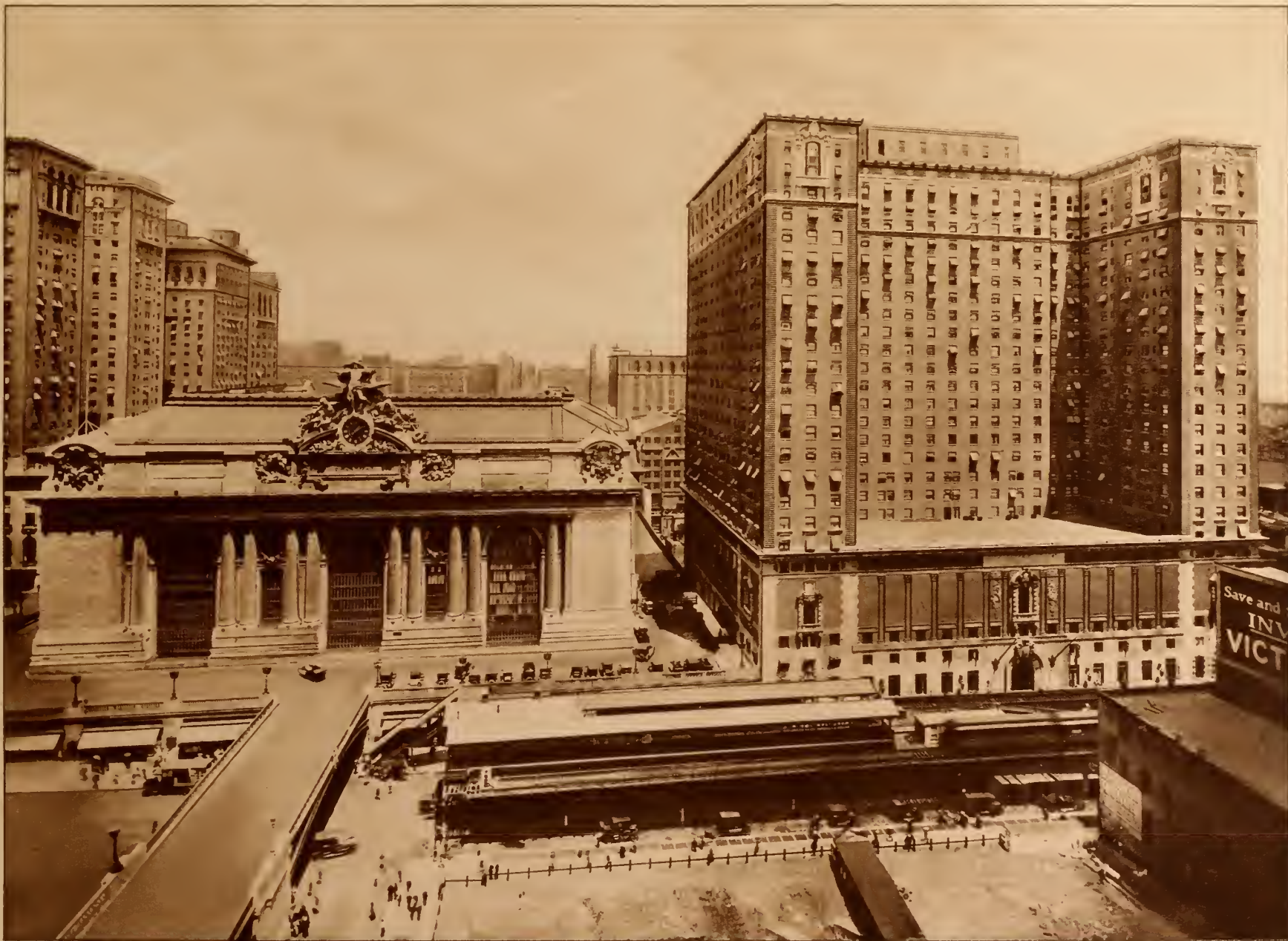
GRAND CENTRAL STATION AND HOTEL COMMODORE. The Grand Central Station covers an area of 69.8 acres and has 31 miles of tracks capable of landing 200 trains and 70,000 passengers per hour. The Hotel Commodore is connected with the station by subway. It has 2000 rooms and is most modern in equipment.